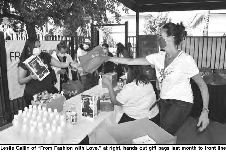
workers at Pomona Valley Hospital Medical Center, many of whom have been helping with the ongoing flow of COVID-19 patients during the pandemic.

our heroes," she added. "Every day, we witness nurses who step up to take care of the sickest, regardless of personal risk."