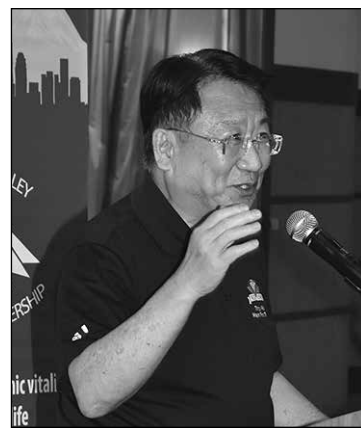
Mayor Pro Tem Tony Wu