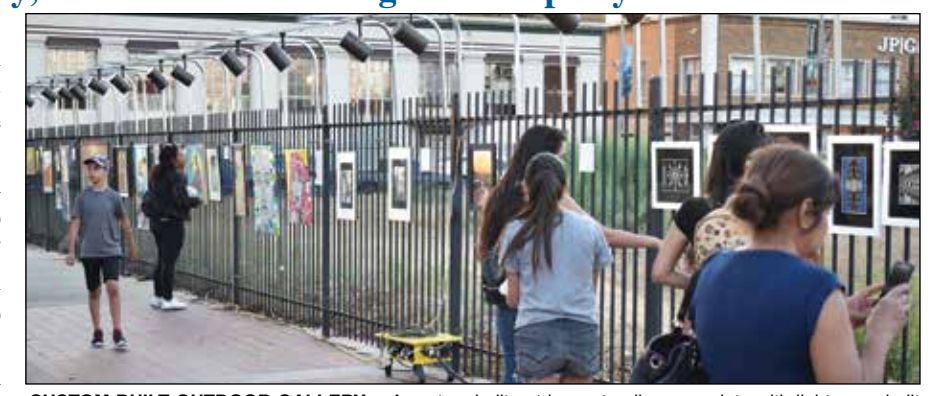
CUSTOM-BUILT OUTDOOR GALLERY -- A custom-built outdoor art gallery complete with lights was built along the fence on Second Street for this month's 25th anniversary celebration of the Downtown Pomona Arts Colony.