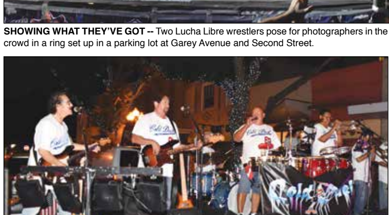
The Band "Cold Duck" was popular at the Arts Colony anniversary party this month, performing on a stage in the middle of Second Street with a set list ranging from the songs of "Chicago" to Johnny Cash.