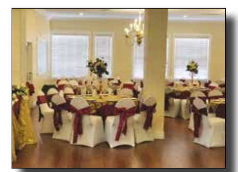
Banquet Hall available for 300 people! ¡Salón disponible para 300 personas!