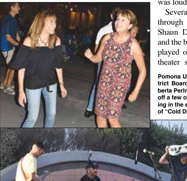
Several bands played on a rotating schedule on Shaun Diamond Plaza at the 25th anniversary party this month in Downtown Pomona.

and two more "on the ground" sets for bands, and Ink'd Chronicles on Second Street even had a band inside the tattoo shop – and yes, it