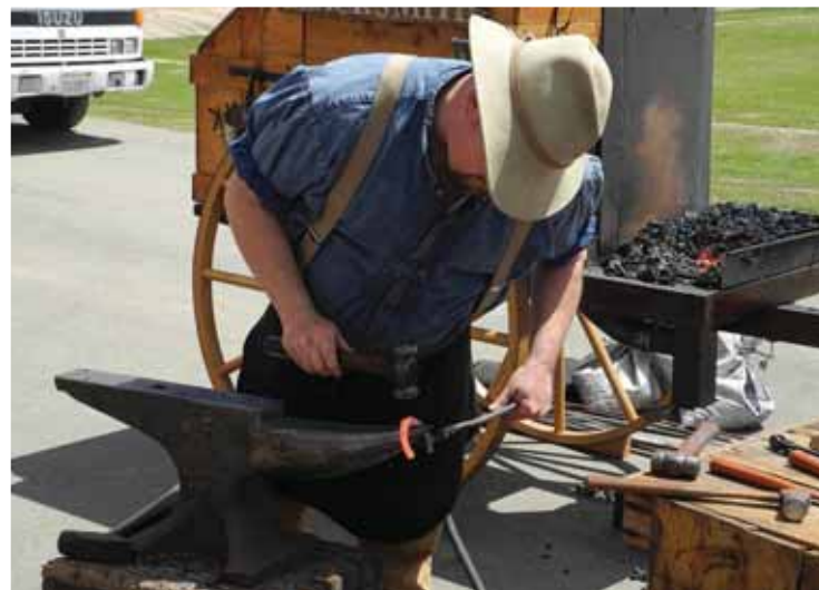
THE OLD-FASHIONED WAY -- Representatives of the Kimberland Traveling Forge, whose motto is "Hand crafting our future by celebrating the past," was on hand this month at Spring in the Farm at Pomona's Fairplex to show how horseshoes are made the old-fashioned way. The annual event features activities and workshops in rope making, hay baling, corn grinding and more, all to show the community how nearly everything we eat, wear and use comes from American agriculture. The five-acre Farm at Fairplex is an innovative, model agricultural business and educational resource that builds awareness of health food possibilities, educates in areas of farm-related culinary and agriculture disciplines, and provides business incubator programs for the agriculture and food service industries.