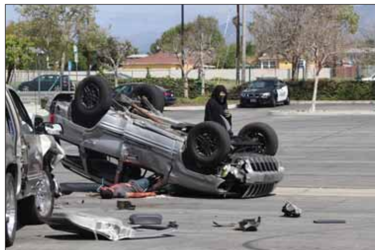
DEMONSTRATING THE DANGERS OF DRINKING AND DRIVING -- A student "victim" thrown from a vehicle in this simulation of an accident scene (and yes, that's the "Grim Reaper" on the other side of the SUV) demonstrates the dangers of drinking and driving as the "Every 15 Minutes" program was presented at Pomona's Village Academy High School this month. The realistic drama, presented to high school juniors and seniors, is designed to get the students' attention since, as the national organization promoting the program states, someone in the U.S. dies from an alcohol related traffic collision every 15 minutes (and the program has been expanded to include texting while driving). The program at Village Academy was presented in conjunction with the Pomona Police Department and the California Highway Patrol. The mock traffic accident was staged in the school parking lot. The following day, students participated in a special assembly to view a video and hear guest speakers.