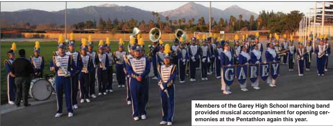
Members of the Garey High School marching band provided musical accompaniment for opening ceremonies at the Pentathlon again this year.