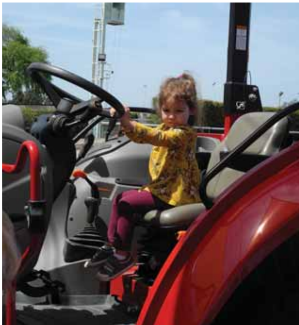
NOW THIS IS WHAT I'M TALKING ABOUT, IT'S HIGH UP AND SHINY! -- A visitor to this month's Farm at Fairplex takes the wheel of a modern farm tractor, one of many tractors -- both old and new -- on display at the event.