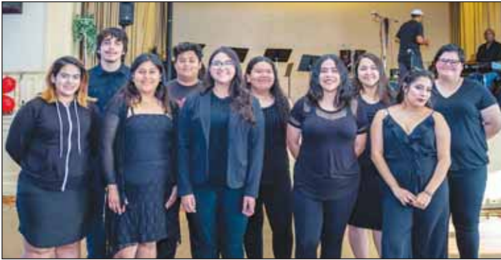
Members of the Garey High School Viking Troopers Choir pose for a photo after their performance at the Ebell Museum.