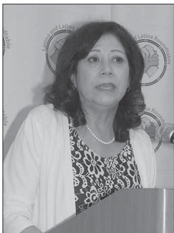
Los Angeles County Supervisor Hilda Solis