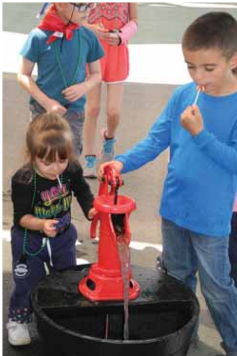
Kids at Spring in the Farm at Fairplex had an opportunity to try their hand at operating an old-fashioned manual water pump. Cal Poly University Pomona's AGRScapes Center participated in this year's event with Fairplex, providing everything from exhibits and workshops to the hayride around the event.