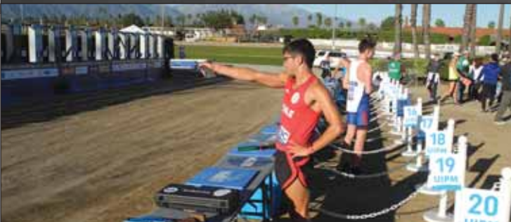
An athlete takes a shot with his laser gun after completing his run in the laser run competition at Fairplex.