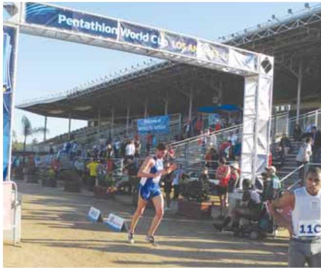
Athletes cross the finish line for their run in front of the Fairplex grandstand before heading over to the laser gun portion of the event.