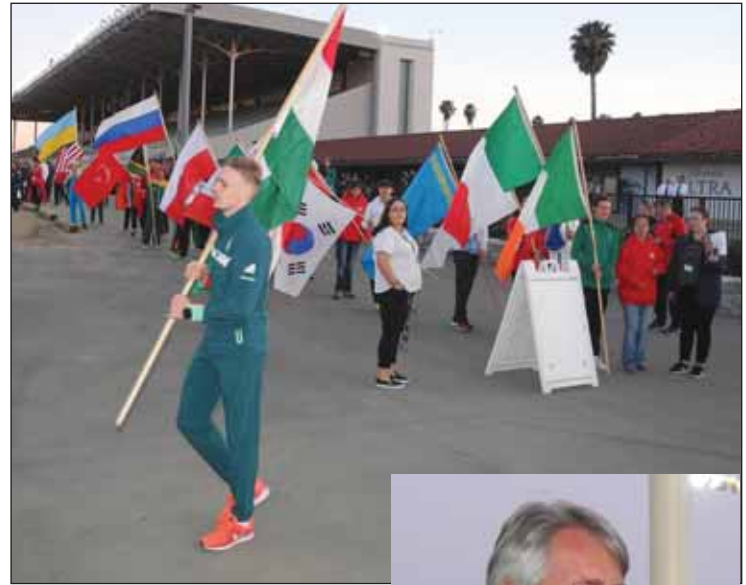
OLYMPICS PARADE OF NATIONS – Olympics competitors from some 30 countries all over the world line up near the grandstand for the traditional Parade of Nations at opening ceremonies of the 2018 Modern Pentathlon, at Pomona's Fairplex last month for a five-day run. Events included swimming, fencing, horseback riding and a "laser" run. It was the Pentathlon's second year at Fairplex. The Modern Pentathlon was introduced to the world in the 5th Olympiad in Stockholm, Sweden, in 1912. While the original pentathlon events were modeled after skills needed by Greek soldiers at the time, the modern events are modeled after skills needed by a more modern day cavalry behind enemy lines.