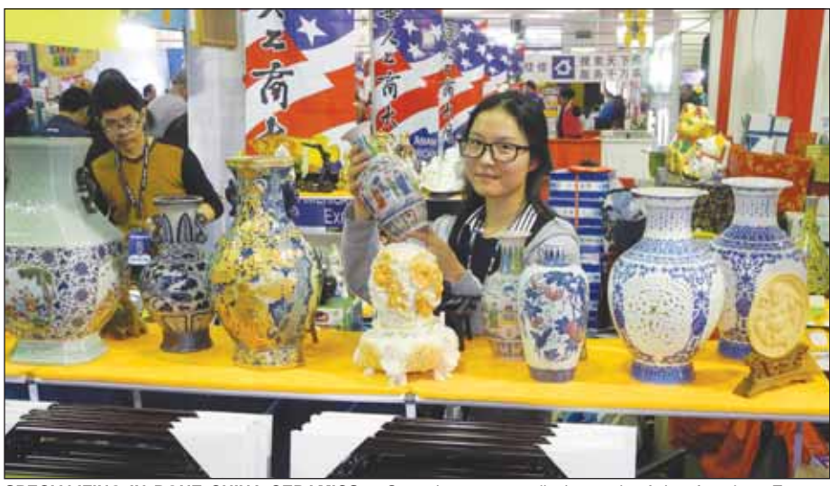
SPECIALIZING IN BONE CHINA CERAMICS -- Ceramics were on display at the Asian American Expo at Fairplex this month. This booth, Jingdezhen Rongyuan Ceramics LLC, based in China but with a local office in Hacienda Heights, even provides custom design work.

keep you posted on how it works out.) Thousands of visitors attended this year's event and the Pomona Police Department issued a special traffic advisory due to the congestion -- and tram crossing activity -- along White Avenue.